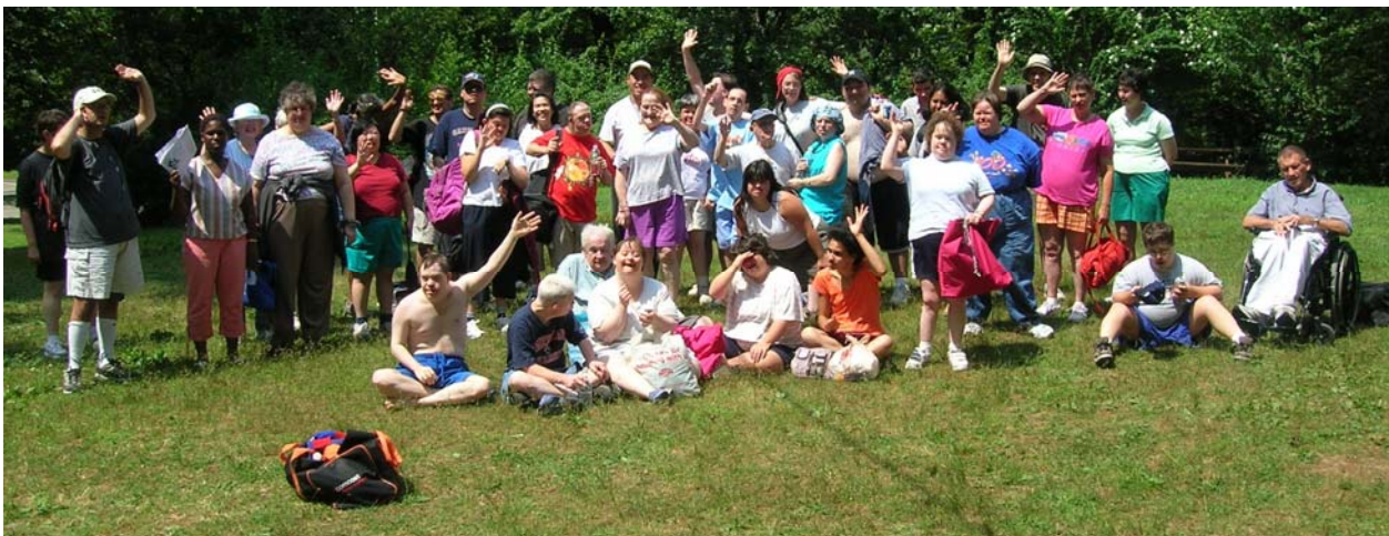
EPT CONSUMERS GATHER FOR ANNUAL COOKOUT

The program is a four week program and the students learn, earn and enjoy themselves.