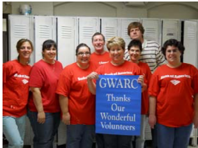
Day 1: the lockers are primed