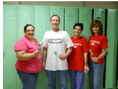
Day 2: the lockers are painted

Volunteers from Bank of America generously donated their time over the course of two days to paint the lockers at our Chestnut Street building on May 24th and 25th. The painters scraped, sanded, primed and painted, transforming the lockers from gunmetal grey to a beautiful sea glass green. The consumers and staff love the new color. Thanks Bank of America!!