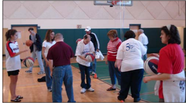
GWARC consumers and friends made the First Annual GWARC Bounce-a-Thon a success. Consumers, their families, friends, and GWARC staff bounced basketballs on September 29 at McDevitt Middle School. See you next year!

GWARC staff and consumers collaborate to accomplish consumers' goals throughout the year. Whether those goals are work-related, life skills, or artistic expression, GWARC consumers work hard to accomplish those goals with staff support and encouragement. But after the hard work, celebrations are in order, and GWARC celebrated 2007 in style!