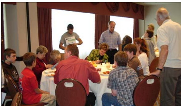
The 2007 Harvest Breakfast was another successful event at the Double Tree in Waltham. Tickets sold out!

We value contributing to the quality of life of our consumers — it's clear that all of us enjoy our work and play — the best of both worlds!