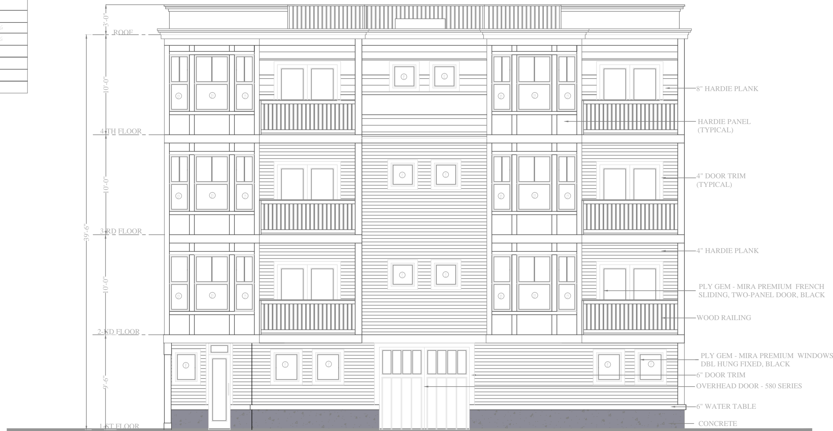
WEST 2ND ST. ELEVATION 5/16\"/>