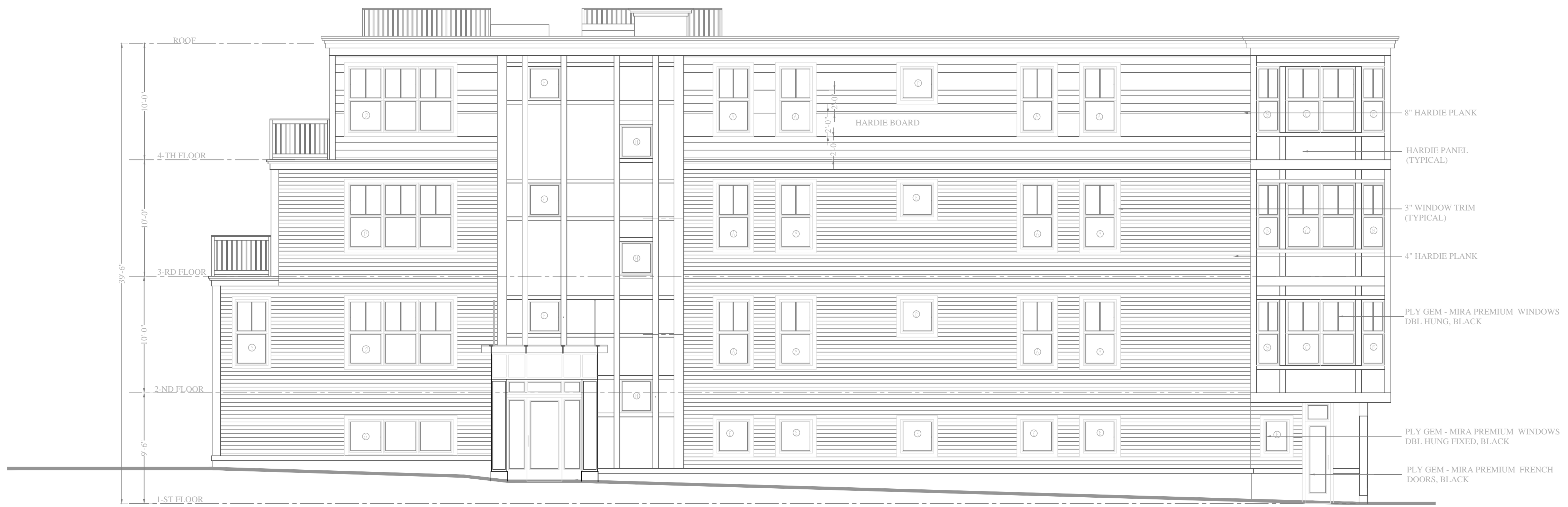
C STREET ELEVATION 5/16\"/>